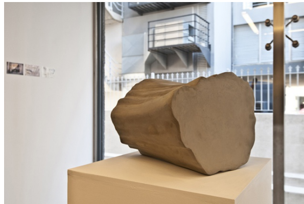
Lamia Joreige, Under-Writing Beirut - Mathaf (2013). Mixed-media installation, commissioned by the Sharjah Art Foundation. View of exhibition at Art Factum Gallery, Beirut.

On her recent project, Under-Writing Beirut - Mathaf (2013), Lamia Joreige wrote: 'When excavating specific instances or locations, whether from the past, present, or projected future, intertemporal continuities and ruptures surface via what persists, what has vanished, and the promise of knowing and imagining inherent in both.' Mathaf , the Arabic word for museum, Joreige continues, 'is a historically significant area that is home to the National Museum of Beirut.' It is also the neighbourhood where Joreige lives, which explains why the artists chose to conduct an archaeology of sorts that explored the many layers and foundations that constitutes this museum's form, content and function, which in turn reflect on the history of Beirut - or Beyrouthe - itself. This underwriting is an approach Joreige has taken in many of her projects. Beirut, Autopsy of a City (2010), is an installation that 'proposes possible reconciliations between the task of the archaeologist and that of the poet, between modern images and ancient texts.' As Joreige writes, 'In the middle of tales of conquest and defeat that shaped (and disfigured) Beirut, one wanders amidst narratives that point out to the impossibility of constructing a grand history.' In this interview, Joreige discusses the logic behind her investigations.